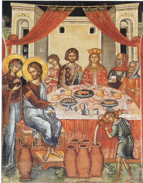
The Wedding at Cana. John 2:1-11