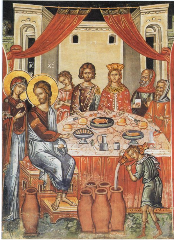
The Wedding at Cana. John 2:1-11