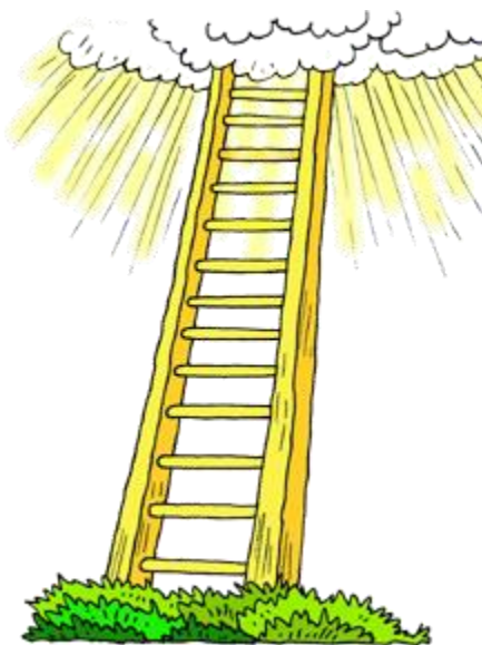
Jesus is our only ladder to heaven

As always, we trust that being aware of the parish's financial position will guide you in any decisions regarding contributions, investments, and other activities.